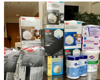
Thank you all for your donations!